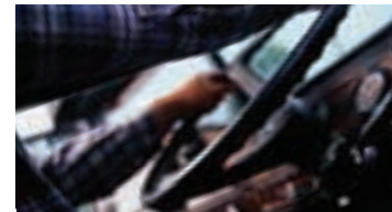
DOT-compliant collection sites