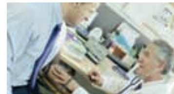
Pre-employment physical exams

For more information on how our extensive network of collection sites and comprehensive services can help you achieve your drug and alcohol testing goals, visit us at www.questdiagnostics.com , contact your Quest Diagnostics representative or call our customer service department at 800-877-7484.